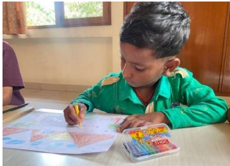
The Art Competition revealed amazing talent