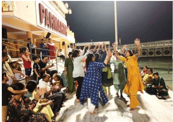
Spontaneous dancing at Parmarth Ashram

The group reveled in the devotional ambiance including aartis , bhajans , dances and memorial diyas floating on the Ganga. They enacted 2 role plays, 'Protection Against Covid' and 'Cleaning the Ganga' for the benefit of pilgrims and tourists. They also visited famous temples, bathed in the Ganges, and experienced the holiness of Ganga Ma.