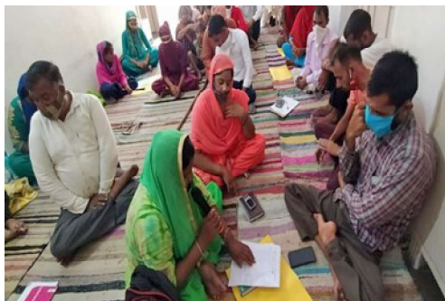
PWDs with Sahayaks participate in group activity to formulate simple business plans for food preservation businesses

20 differently abled persons participated in food preservation courses conducted by the Kalpana Chawla Skill Center in Karnal. Arpana conducted a gathering so they could look into livelihoods options. There were lively discussions and several emerged with practical ideas for self-employment, i.e. dairy, pickles, sauces and fast food. Five of these differently abled persons came to Arpana's workshop to give their plans a practical shape.