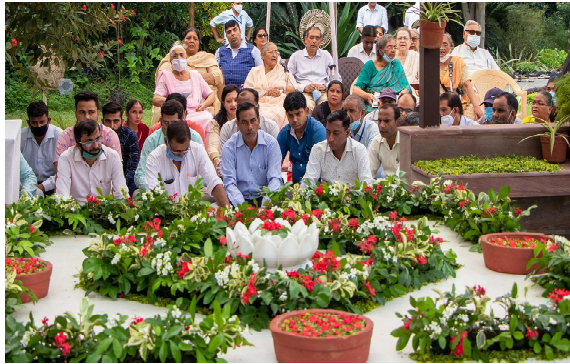
Urvashi Day at Samadhi Sthal