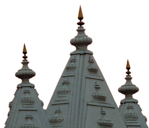
The Arpana Temple