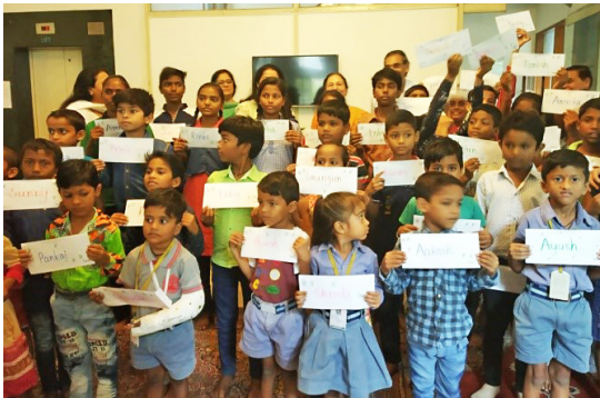
Children who received scholarships at Rejoice.

Arpana's Rejoice Centre in Vasant Vihar held its first term Scholarship program on 12 th October. 50 children were awarded Scholarships under five categories. This provides motivation to stay in school as well as small, but important supplemental assistance to help them do so.