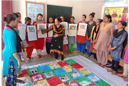
Games on mental health awareness with teenage girls and young ladies

3 teachers from Arpana Trust participated in a workshop on 'Communication on Mental Health' at Lady Irwin College. They then conducted awareness sessions for young people at Arpana Educational Centre, Molar Bund, using games to engage participants in a dialogue to create awareness about mental health.