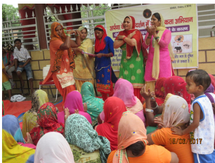
SHG volunteers playing role play on water born diseases